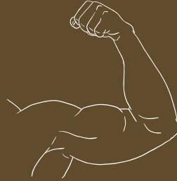
2. Muscle Collaboration